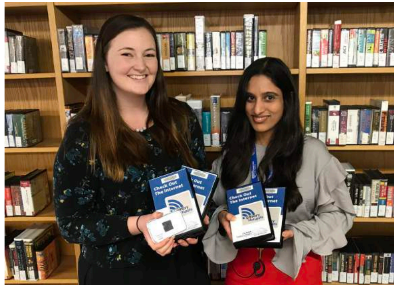
With unlimited data, CPL hotspots can provide access for an entire household or all employees of a small business.

Caledon residents can now place requests for hotspots using the Library’s online catalogue and any late returns will be subject to overdue fines. For more information, or to borrow a hotspot, visit the library website or drop in to one of our 6 branches.